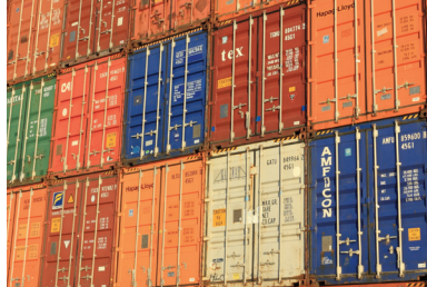
SHIPPING & LOGISTICS